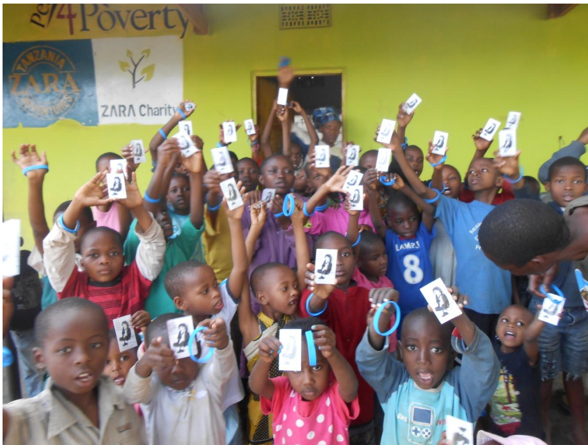
Zara Charities Orphanage in Moshi town, Tanzania AFRICA 2013