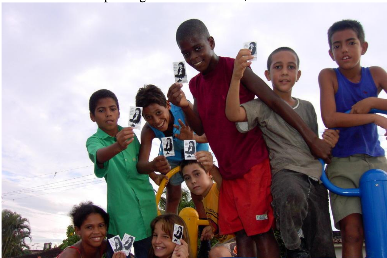
At one of the playground built in Havana Cuba 2005